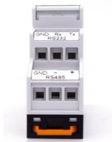
Fig.2 RS485 serial connection ←

NetLink allows you to bridge the serial RS485. The terminals for the connections of the serial port are as in Fig. 2.