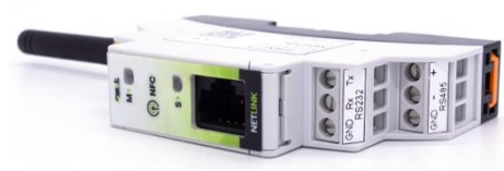
→ Fig.3 Ethernet connector

For connection to the Ethernet network, NetLink is equipped with the RJ45 connector on the front panel (Fig. 3). When connected to an Ethernet network, the status LED turns green. When there is communication, the green LED flashes.