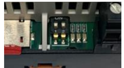
Fig.6 Example of DIP SWITCH: OFF OFF ←

N.B. Use this option when connecting a maximum of one EasyNET in the same LAN network.