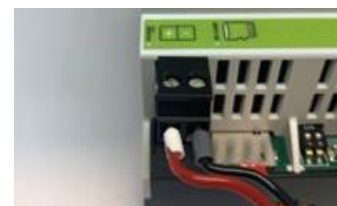
Fig. 4 Power connection ←

It is recommended to respect the polarity.