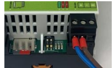
Fig. 2 RS485 connector ←

If using serial to read data from ModBus RTU devices, connect the RS485 wires as shown below: